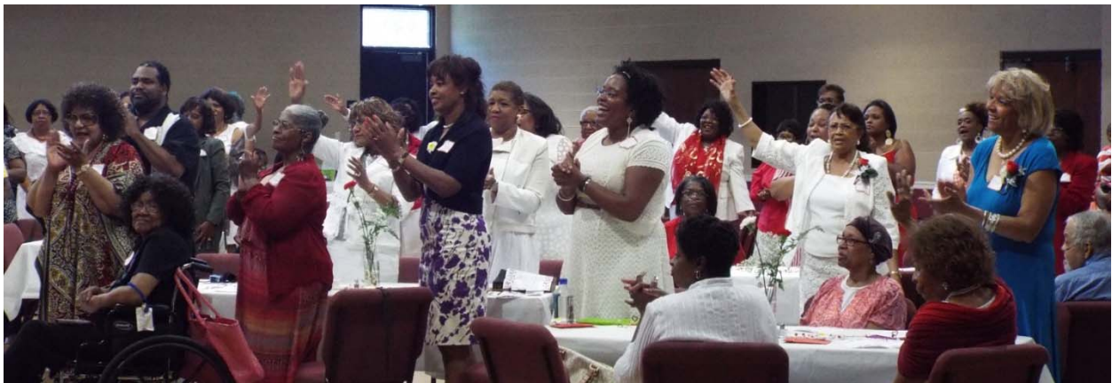
Guests show their appreciation