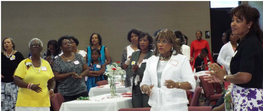
More to Come